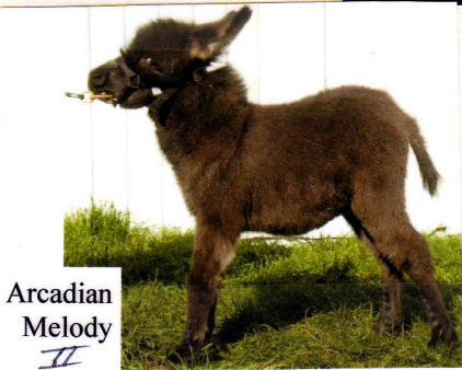
Arcadian Melody II

The American Donkey and Mule Society P.O. Box 1210, Lewisville, TX 75067 (972) 219-0781 The American Donkey and Mule Society is not responsible for errors in information submitted to the registry.