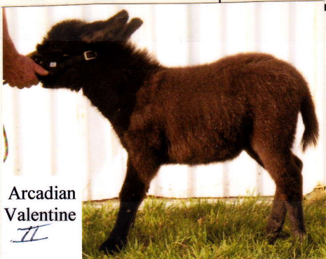
Arcadian Valentine II

The American Donkey and Mule Society P.O. Box 1210, Lewisville, TX 75067 (972) 219-0781 The American Donkey and Mule Society is not responsible for errors in information submitted to the registry.